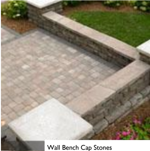
Wall Bench Cap Stones